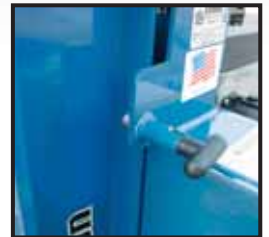
Quick release handles lock the rail in both the horizontal and vertical positions.